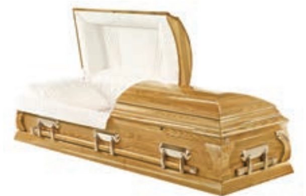
Ash Casket - Cream Interior $2600.00