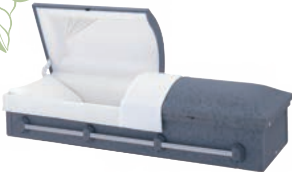
Grey Cloth Casket $999.00