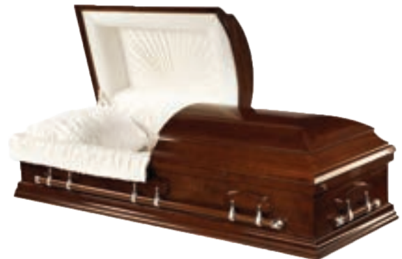
Maple with High Gloss Finish $3200.00