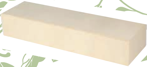
Cremative Container $200.00