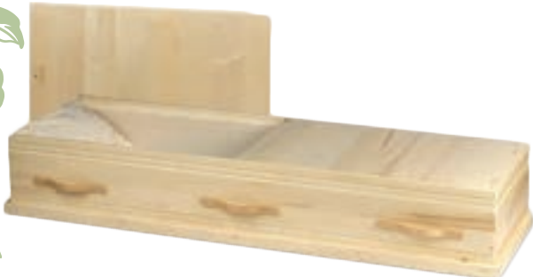
Eden Enviro Casket $500.00