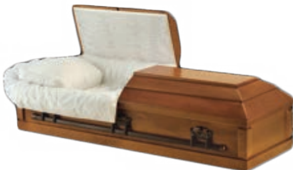
Ash Casket - Ivory Interior $2350.00