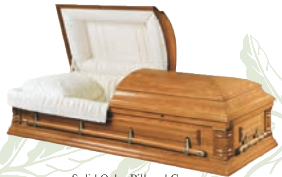
Solid Oak - Pillared Corners Oval Top - Hand Ruffled Finish $4600.00